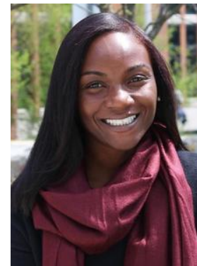
Dr. Kizzmekia Corbett

HOURLY POWER PRAYER TELE-CONFERENCE IS EACH SATURDAY AT 10AM: CALL 978-990-5000, CODE: 509176